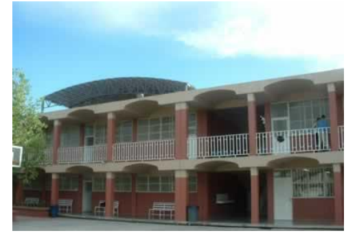
Colegios Particulares A.C.