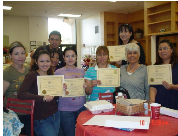
Graduation day, Spring 2009